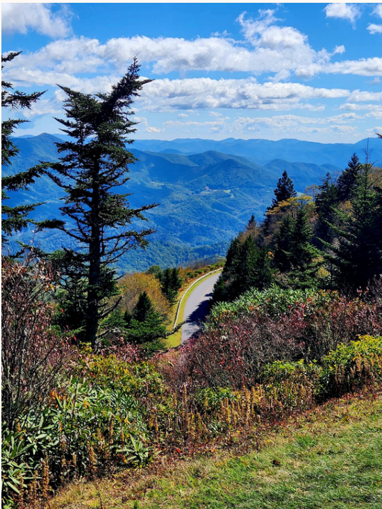
Fall Views.

The next project is scheduled for November to replace the 4" valve on the 6" line by the little pond at Dogwood and Azalea. Affected homeowners will be notified of this project which should take approximately four (4) hours.