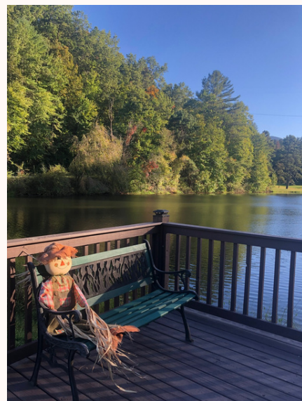
Fall Decorations.