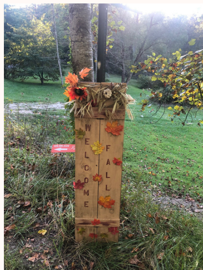
Fall Decorations.