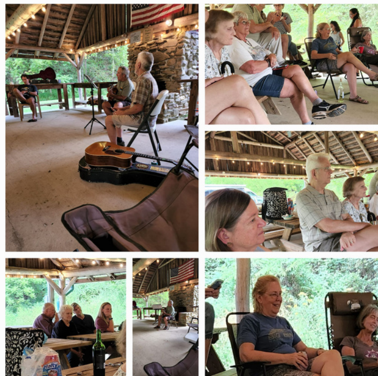
Music in the Valley.