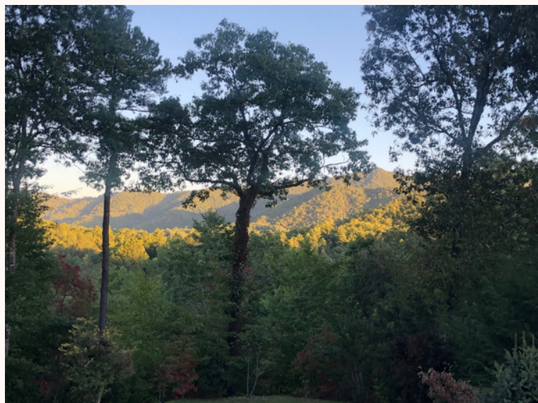
Fall Views.