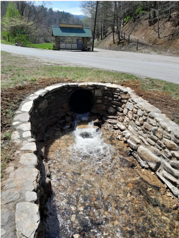
BEFORE AND AFTER OF REPAIRS MADE TO CREEK IN FRONT OF 579 PROPERTY