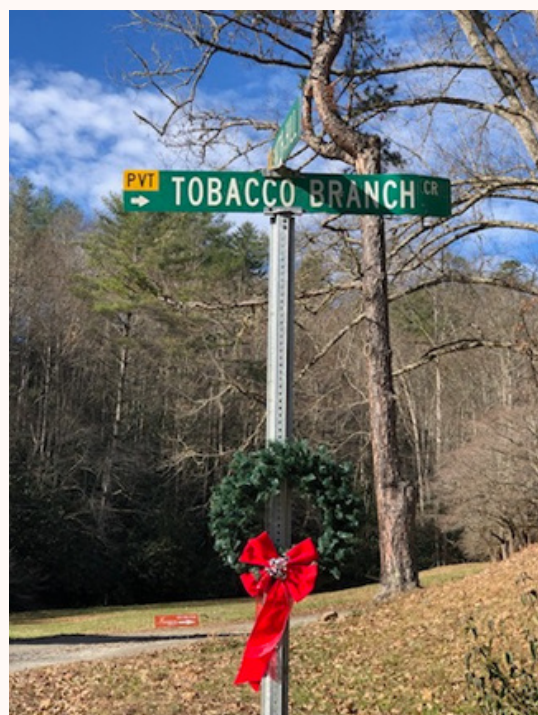
Fall and Christmas Decorations.