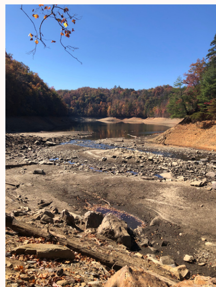
Fall Views and Nolan Creek Hikes.