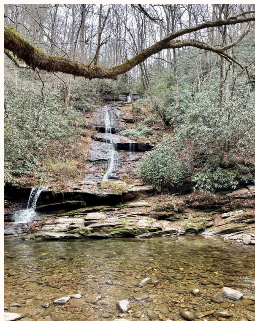
Deep Creek Waterfall Hikes in the Fall