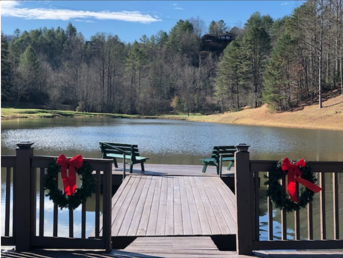
Christmas Decorations .

THE NEWSLETTER OF TOBACCO BRANCH VILLAGE